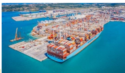
Port of Koper - Container Terminal

Living Lab Koper focuses on development and demonstration of novel 5G technologies targeting future European ports (e.g., cloud-native and MEC driven infrastructures, MANO-based services and network orchestration, Industrial IoT, vehicle telemetry, AI/ML based video analytics, drone-based security monitoring etc.) and cutting-edge prototypes tailored to the needs of port environment. The most demanding port logistic operational scenarios and mission-critical applications are supported through a combination of a national 5G NSA network extended with MEC mechanisms and a private 5G SA deployment. NFV-MANO is selected for orchestration as it provides means to efficiently provision, deploy and manage the life-cycle of the 5G network infrastructure and Industrial IoT services. Hybrid private-public 5G network operations enable verification of novel features, such as eMBB, mMTC and URLLC services, network slicing, NFVI and multi-1aaS scenarios operated in realistic port settings.