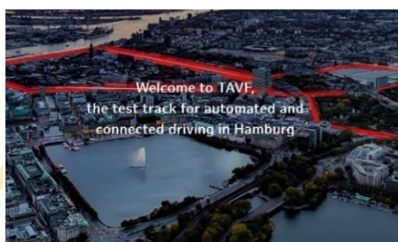
Automated Vehicle Platoon

The Living Lab Hamburg will demonstrate 5G innovations for logistics in the Hinterland of the harbour of Hamburg by using the public 5G network operated by the Deutsche Telekom. This public 5G network covers the designated test field for "connected and automated driving" (TAVF) of the city centre of Hamburg. Within this environment, the Living Lab Hamburg will illustrate how new functionalities of 5G such as Mobile Edge Computing (MEC), precise positioning and low latency communication (uRLLC) can improve the efficiency of logistic operations with regards to collision-free automated driving in a platoon or single-mode to connect hinterland corridors to container terminal. On the other hand, it will be demonstrated, that improved 5G network functionalities such as massive Machine Type Communication (mMTC) and enhanced Mobile Broadband (eMBB) are essential not only for any future mobile network applications but will also help city and port road managers to reduce peak time delays and congested multi-modal logistic operations making use of 5G in the context of goods' transport.