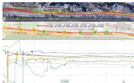
Automated Vehicle Platoon